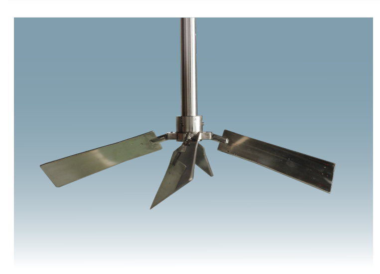
Figure 3: When impellers are in rotary motion.

The machine base is fitted with ON/OFF starter, limit switch and clamping system to prevent accidental mixer operation when it is not inside the IBC container.