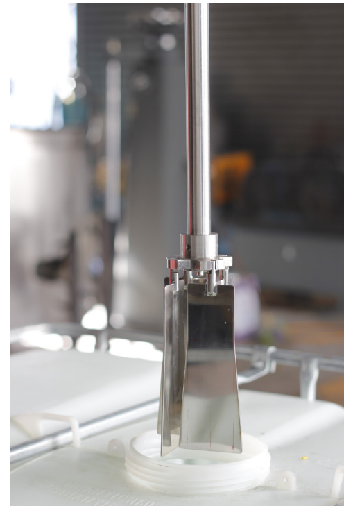
Figure 2: "Collapsible" folding impellers for entry to all standard IBC containers.