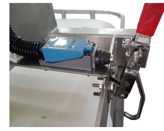
Figure 4: Safety mechanism with clamping and limit switches.

CKL Multimix (M) Sdn. Bhd. (293804-M) No 21 & 23, Jalan Industri Mas 12, Taman Mas Sepang, 47100 Puchong, Selangor, Malaysia.