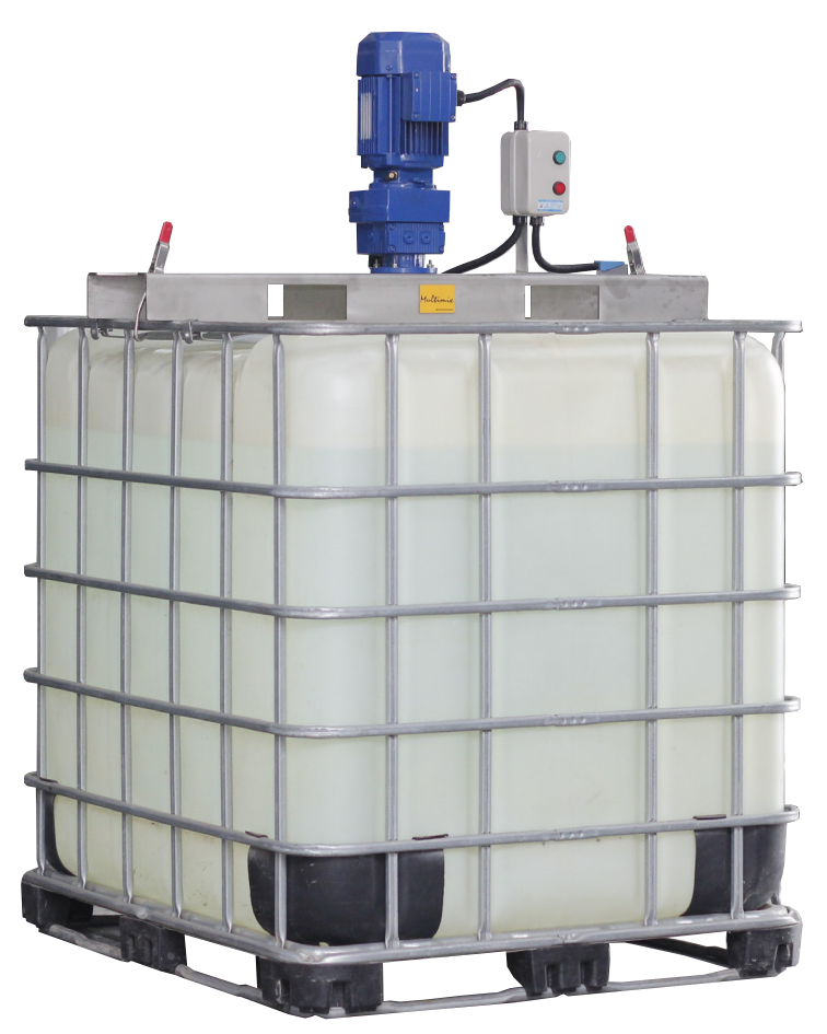
Figure 1: IBC mixer designed solely for use with transportable plastic intermediate bulk container (IBC). containers.

In chemical industries, the chemical solutions are commonly stored in the form of IBC container and kept in a warehouse for storage. Depending on the scale of mixing, the batches produced are very large and thus the containers are kept for a long period of time, up to months until it is distributed to customers. Thus, some sediments will start to form and drop to container bottom or the solvents will start to separate. Multimix® IBC fluid mixer also known as IBC tote mixer has four fan-shaped folding impellers and when in rotary motion, creates a vortex to agitate the fluids in IBC container and thus prevent sedimentation at the bottom.