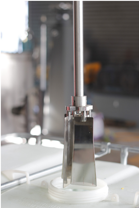
Figure 2: "Collapsible" folding impellers for entry to all standard IBC containers.

The base is fitted with dedicated forklift channels enabling it to be transported in and out IBC containers via forklift.