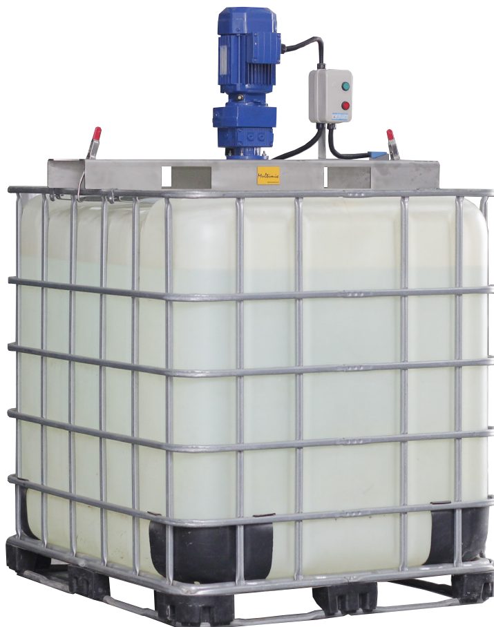
Figure 1 : IBC mixer designed solely for use with transportable plastic intermediate bulk container (IBC). containers.

In chemical industries, the chemical solutions are commonly stored in the form of IBC container and kept in a warehouse for storage. Depending on the scale of mixing, the batches produced are very large and thus the containers are kept for a long period of time, up to months until it is distributed to customers. Thus, some sediments will start to form and drop to container bottom or the solvents will start to separate. Multimix® IBC fluid mixer also known as IBC tote mixer has four fan-shaped folding impellers and when in rotary motion, creates a vortex to agitate the fluids in IBC container and thus prevent sedimentation at the bottom.