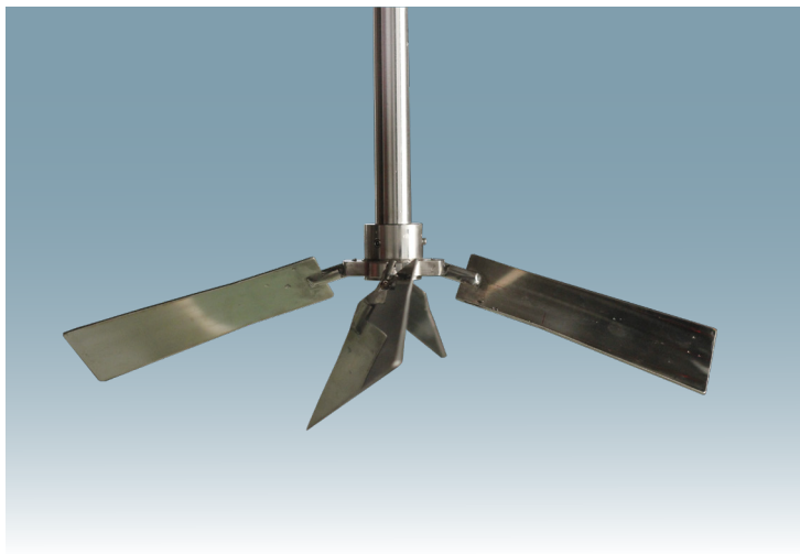
Figure 3: When impellers are in rotary motion.