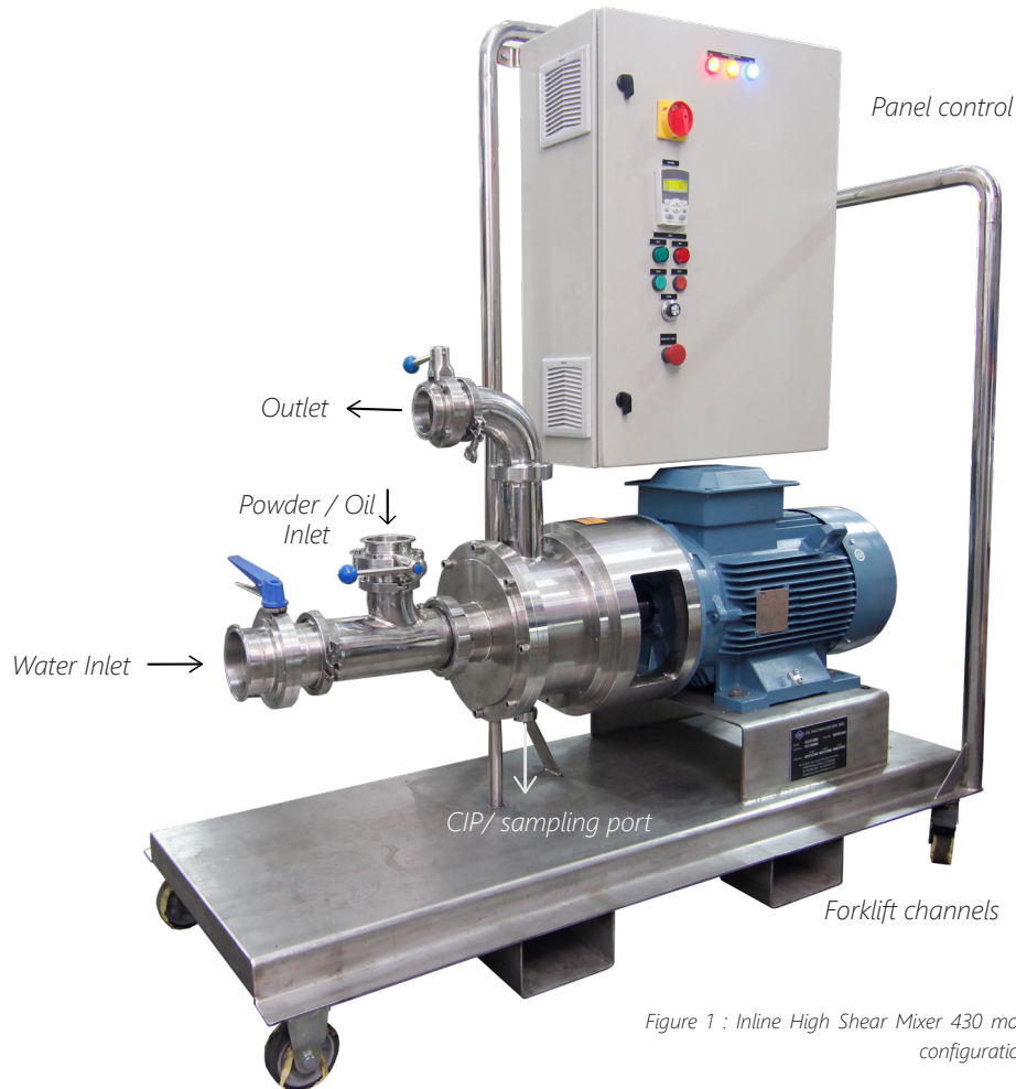
Figure 1 : Inline High Shear Mixer 430 model with panel control and trolley configuration.

Multimix Inline High Shear Mixer (IHSM) Series is a versatile and multipurpose mobile high shear mixer designed for the production of fine emulsion and dispersion. The machine is delivered with a mobile stainless steel trolley which makes transportation a breeze and also a stainless steel hopper for ease of inserting the mixing materials. This unit is GMP compliant and capable of flow rates reaching up to 180,000 litres per hour (depending on the model). At the core of each IHSM lies a precision engineered "slotted" stator, designed in double stage up to a maximum four stages. Coupled with the vortex generated by the rotor inside, such design allows maximum shearing of particles as they are sucked and pushed through the sharp edges of the slots.