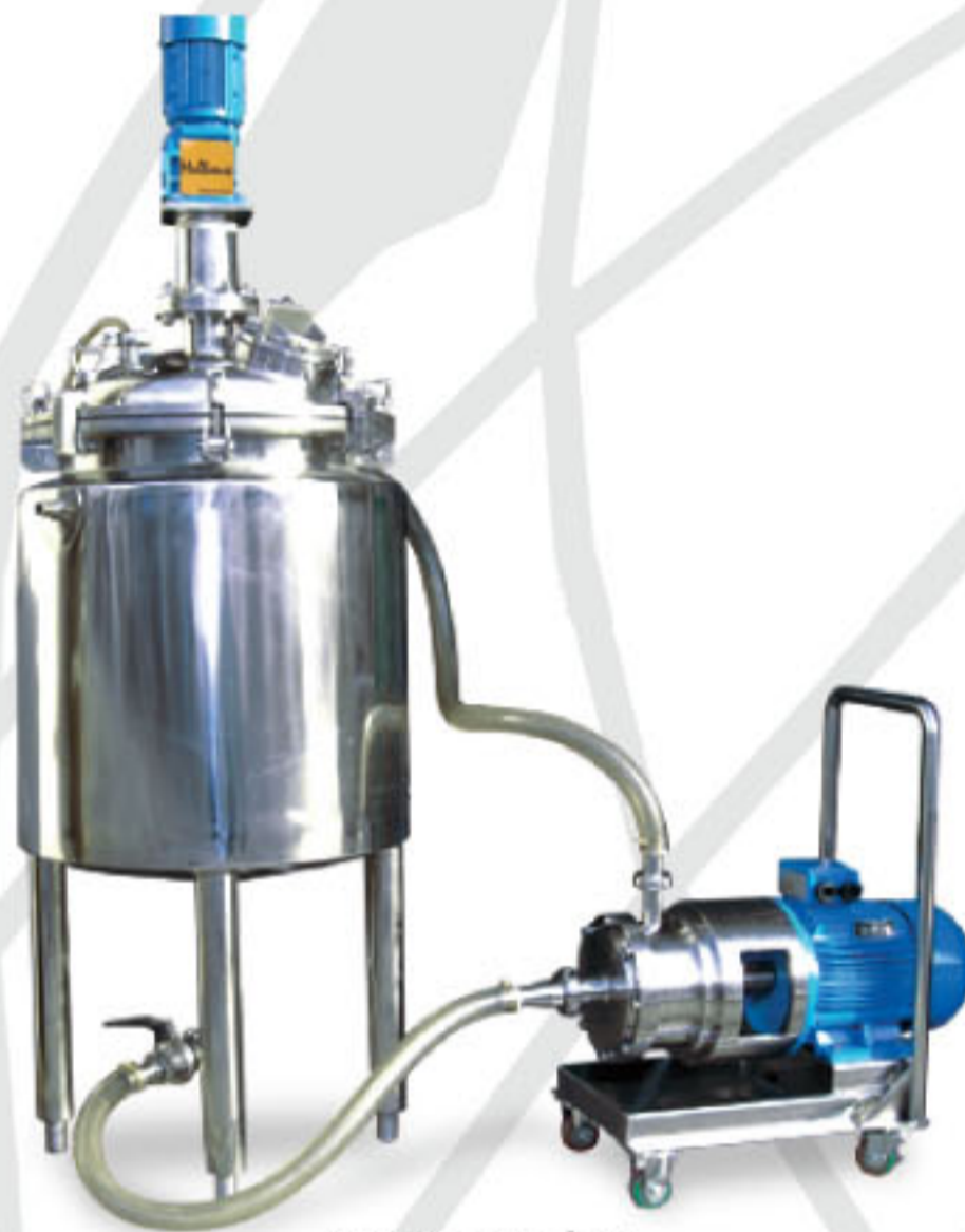
INLINE HSM WITH VACUUM MIXER