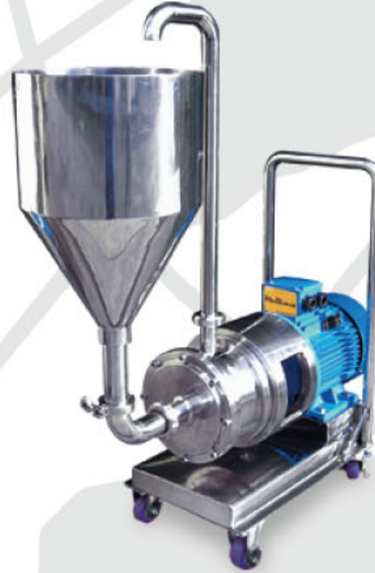
INLINE HSM WITH HOPPER