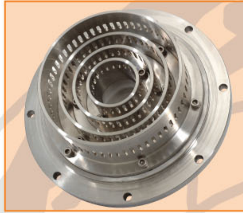
Stator - 4 stage