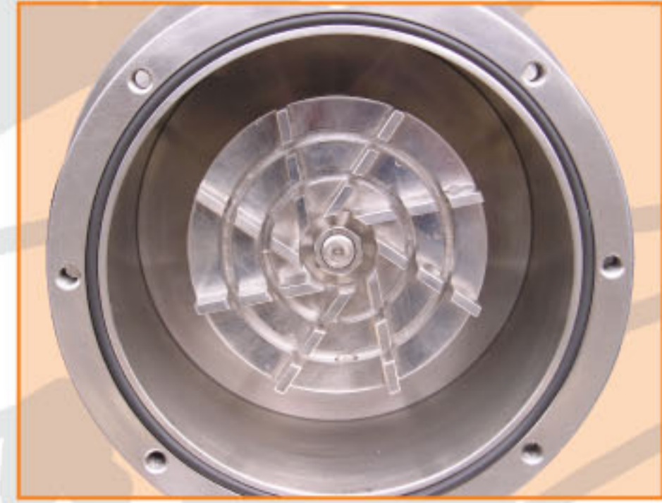
Rotor - 4 stage